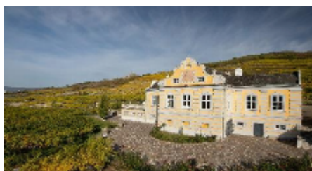
BAROQUE CELLAR PALACE